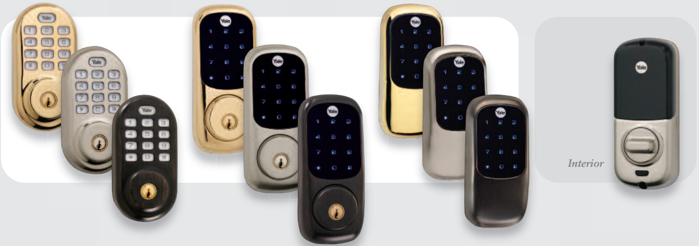
YRD210 Push Button Deadbolt YRD220 Touchscreen Deadbolt YRD240 Key Free Touchscreen Deadbolt US3 Polished Brass • US15 Satin Nickel • US10BP Oil Rubbed Bronze Permanent